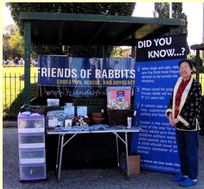
The Friends of Rabbits booth Baltimore Animal Rescue and Care Shelter's BARCStoberfest

We had a beautiful day and had the opportunity to share lots of information with visitors to our booth. We also had a wonderful opportunity to meet the operators of Luna's House located in Abingdon Maryland! We listed their events below in case you are interested in participating at their events.