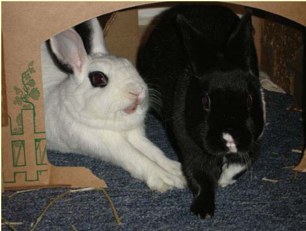
Satine and Barney yawn and stretch as they start their day and exit their bunny castle.

Visit us online at www.friendsofrabbits.org .