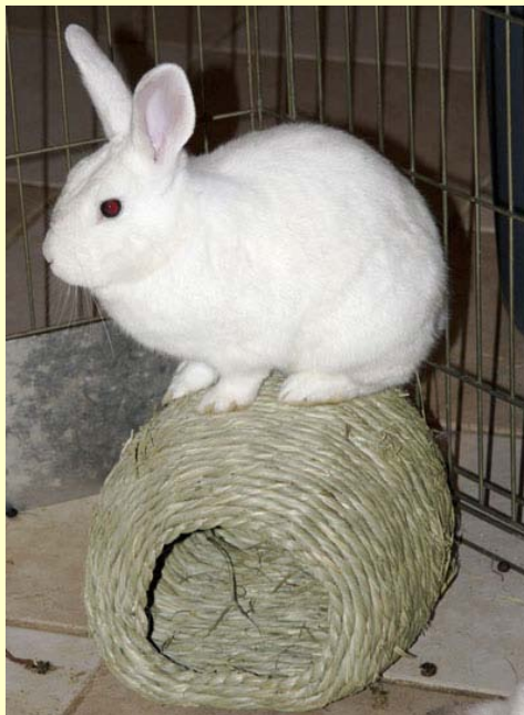
Bun having fun on top of the new Oxbow Bungalow.

Sometimes you need an extra bit of help with your rabbit. For example, if your rabbit needs subcutaneous fluids, we can help you get through the rough times. Many of us have plenty of experience giving subcutaneous fluids and can work with you to build the confidence that you need.